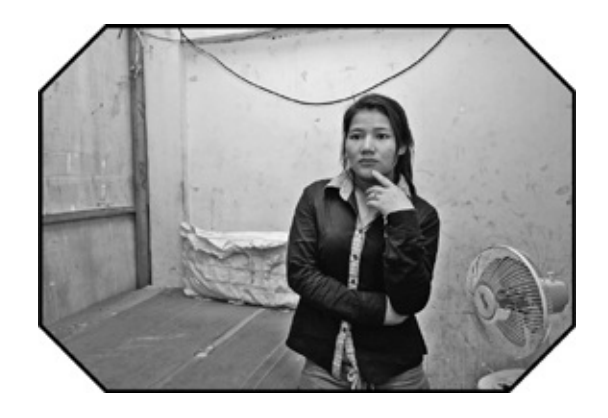
oldsymbol{A} Cambodian teenager, kidnapped and sold to a brothel, in the room where she works (Nicholas D. Kristof)

The tools to crush modern slavery exist, but the political will is lacking. That must be the starting point of any abolitionist movement. We're not arguing that Westerners should take up this cause because it's the fault of the West; Western men do not play a central role in prostitution in most poor countries. True, American and European sex tourists are part of the problem in Thailand, the Philippines, Sri Lanka, and Belize, but they are still only a small percentage of the johns. The vast majority are local men. Moreover, Western men usually go with girls who are more or less voluntary prostitutes, because they want to take the girls back to their hotel rooms, while forced prostitutes are not normally allowed out of the brothels. So this is not a case where we in the West have a responsibility to lead because we're the source of the problem. Rather, we single out the West because, even though we're peripheral to the slavery, our action is necessary to overcome a horrific evil.